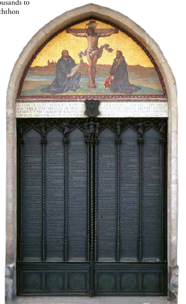
Left: Luther Monument in Marktplatz Right: The Theses Door at Castle Church