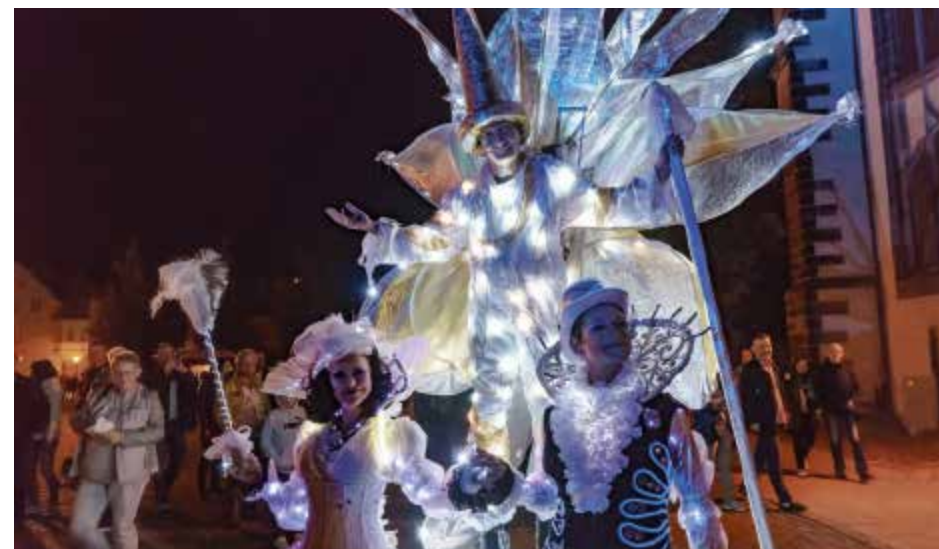
Left: Players for the Adventure Night (Erlebnisnacht)