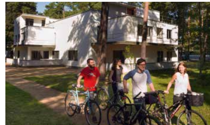
UNESCO World Heritage Site – Masters' Houses and Bauhaus Dessau