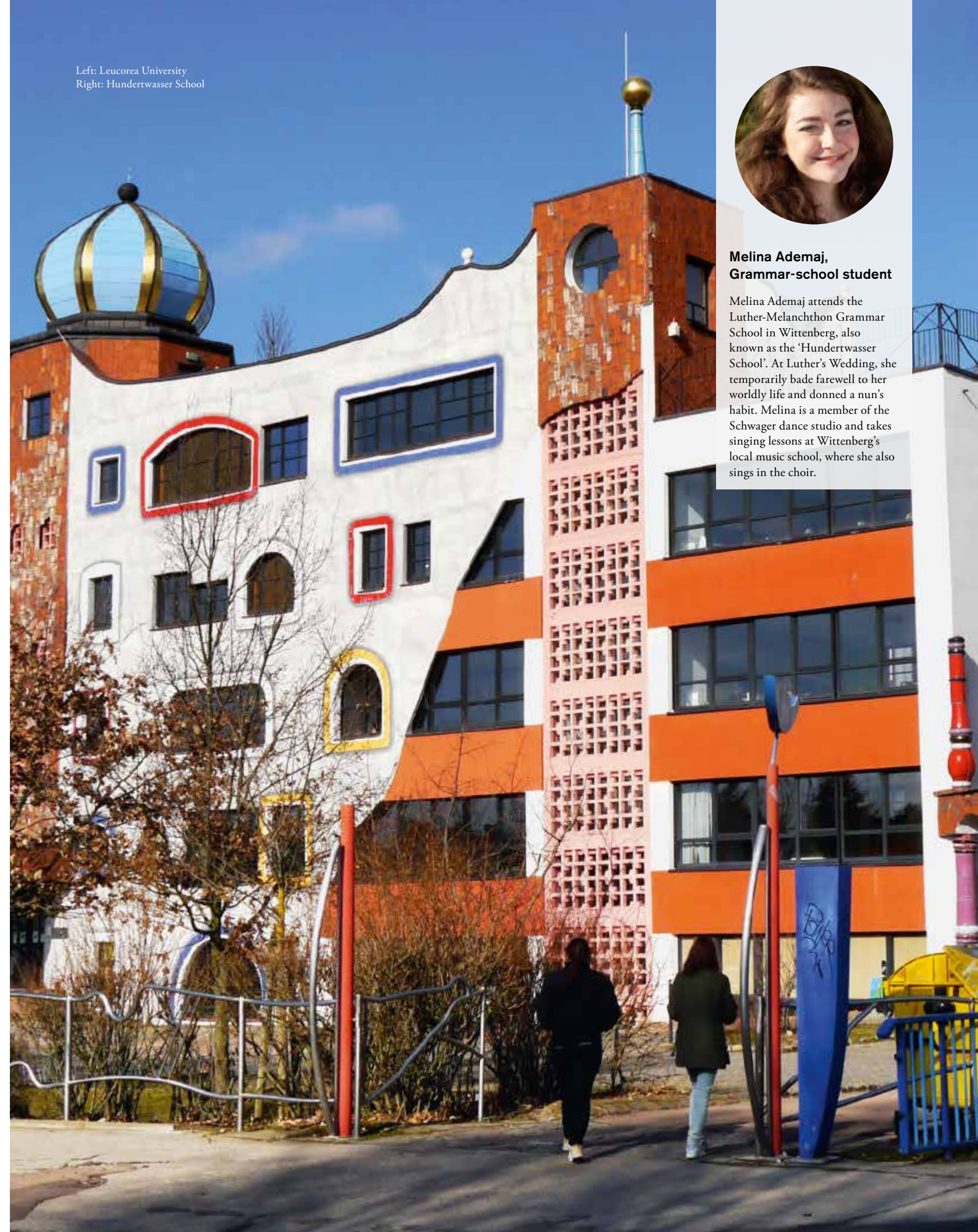
Left: Leucorea University Right: Hundertwasser School

Education and research in Lutherstadt Wittenberg are founded on a robust education policy. It is aimed at maintaining a vibrant town with a strong intake of students every year and attracting a growing number of academic researchers.