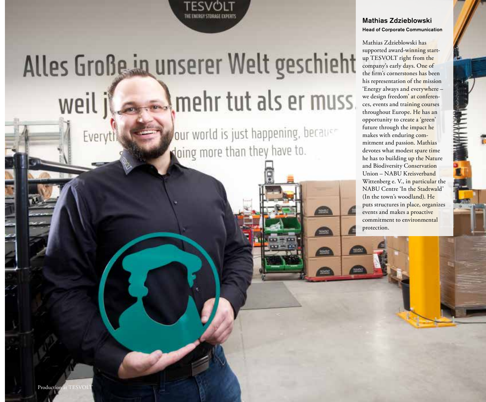
Production at TESVOLT

Feldbinder Spezialfahrzeugwerke GmbH produces silo and tanker trailers, railway freight wagons and containers, tailored to customers' individual requirements, with some 450 employees in Lutherstadt Wittenberg. The family-run specialist vehicle manufacturer is one of the biggest employers and training companies for apprentices in the region and it is currently on a growth trajectory. Modern production methods are at the heart of the company, where aluminium and stainless steel are processed. Owing to the high level of demand in Europe and the high production depth, there is a steady demand for welders and other skilled workers.