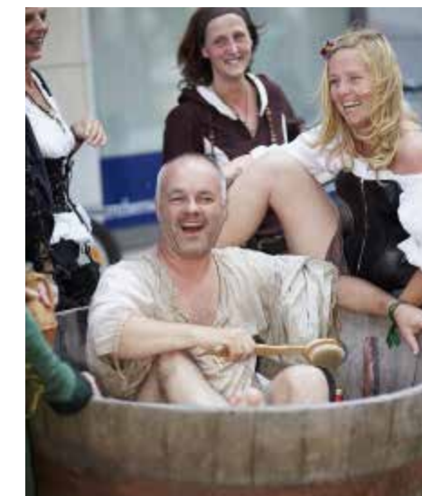
Right: Entertainers in the outdoor hot tub at Luther's Wedding pageant

Shows, cultural events, conferences and concerts continue as a succession of veritable gems in Lutherstadt Wittenberg throughout the year. In the summer, visitors can experience the cultural highlights on the streets of the city.