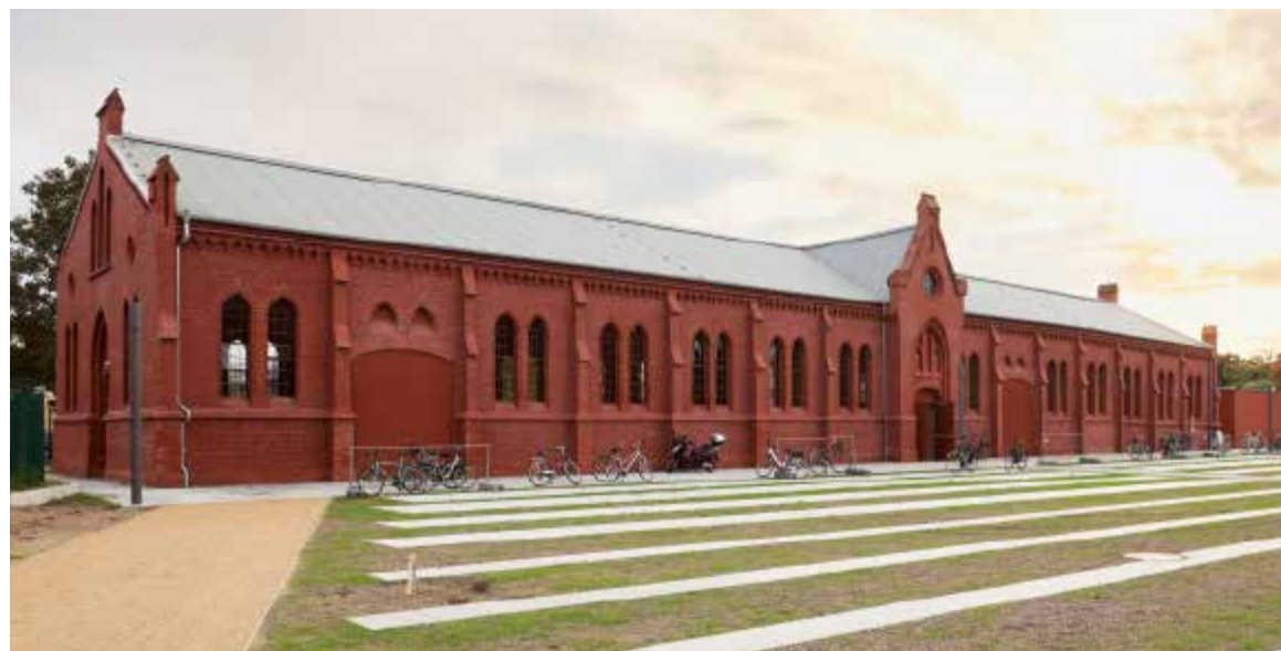
Top: Official opening to celebrate completion of the Exerzierhalle (‘drill hall’) in 2014 Below: Historic brick façade of the Exerzierhalle (‘drill hall’) Right: Foyer and hall of the Stadthaus – arts and conference venue

Anyone planning to hold a major event in an exceptional setting has an ideal venue in Wittenberg Stadthaus, which is also home to the central Town Information Centre. This was opened in 2014 as a leading-edge conference centre with space for 600 people. Alongside conferences and panel discussions, this venue also hosts concerts and exhibitions in spectacular surroundings on the site of a former Franciscan Monastery. The Exerzierhalle (‘drill hall’) is located just 150 metres from the Stadthaus – both arts and conference venues. It presents similar and complementary events to the programme at the Stadthaus on Arsenalplatz. They include concerts, theatrical performances, markets, family events and club celebrations, as well as a popular summer cinema. The Exerzierhalle (‘drill hall’) is a multifunctional venue with floor space of 730 square metres, providing an additional facility to complement the other event venues available in Wittenberg. The Old Town Hall is the ‘most prestigious venue on Marktplatz’ – a setting for exclusive events in a dignified historical ambience.