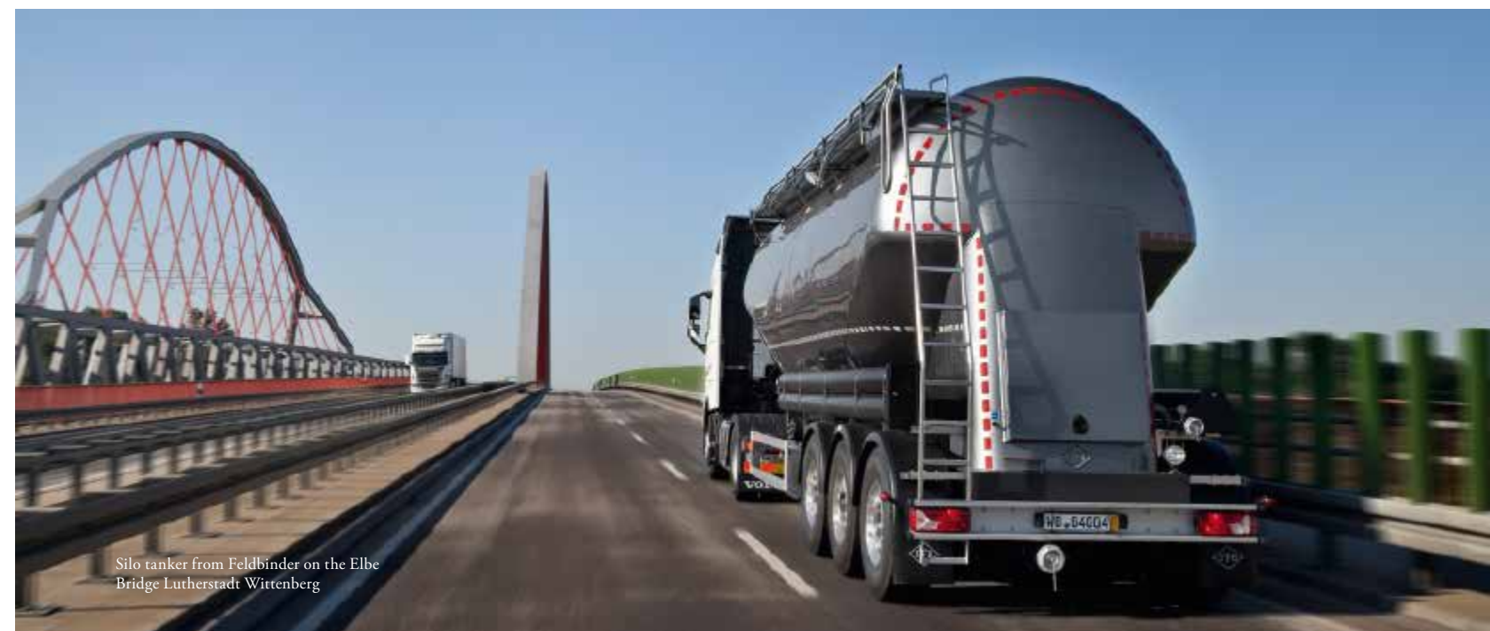
Silo tanker from Feldbinder on the Elbe Bridge Lutherstadt Wittenberg